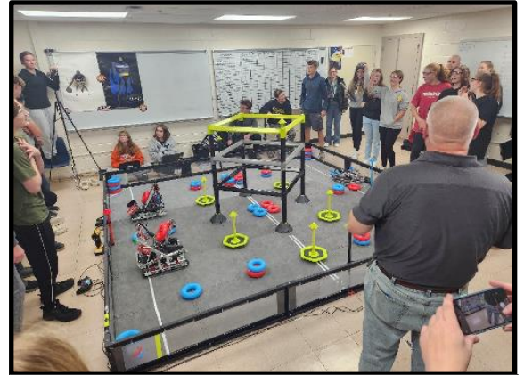
BHS - Arena/robot set-up before it

The way scrimmage nights happen (they are every couple of weeks and are helping the teams to get ready for regional and state competitions) anywhere from 10-16 teams show up (male teams, female teams, co-ed teams, freshmen, senior and mixed teams) with their robots they've tweaked since the last competition. Keep in mind the teams start the year with a kit of parts; no designs, just a kit of wheels, metal "beams," pneumatic pumps, wires, nuts, bolts, you get the idea. AND, they are given the rules for the competition. That's about it. The teams have to start designing their robots to accomplish the task. Understandably the first competition is pretty rough, as only the most savvy, veteran designers are marginally successful. But that's the beauty, other teams get to look at each other's designs and through trial and error improve their designs. Over the course of weeks the designs tend to migrate toward each other and the focus is on skill of driving their unique design.